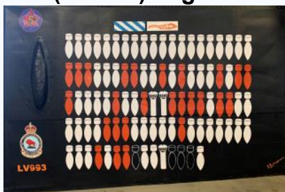
429 Sqn bomb tally