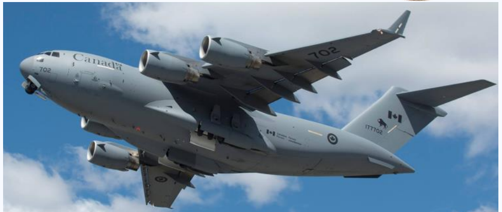
A flypast by a 429 Squadron CC-177 Globemaster