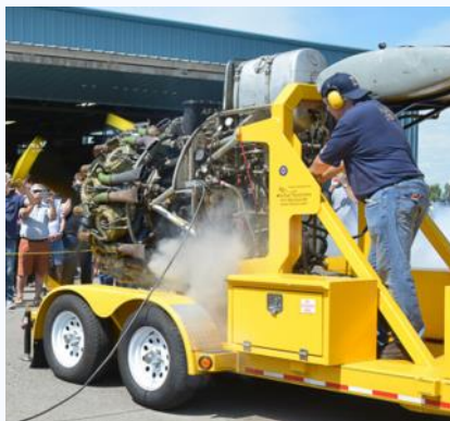
A run-up of our Hercules (Halifax) engine