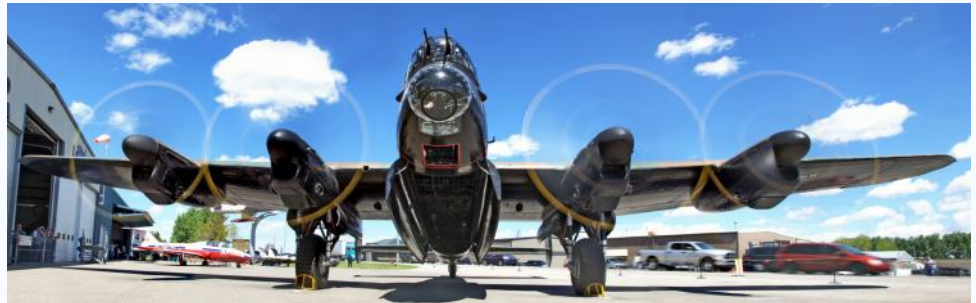
A Lancaster engine run-up to salute 429 Squadron