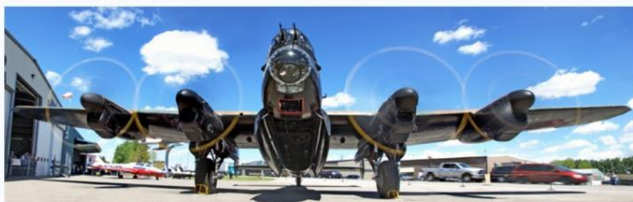
A Lancaster engine run-up to salute 429 Squadron