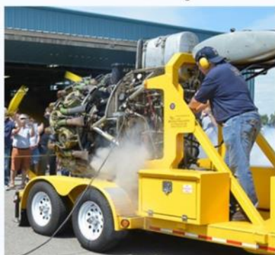
A run-up of our Hercules (Halifax) engine