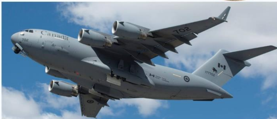
A flypast by a 429 Squadron CC-177 Globemaster