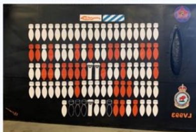
429 Sqn bomb tally