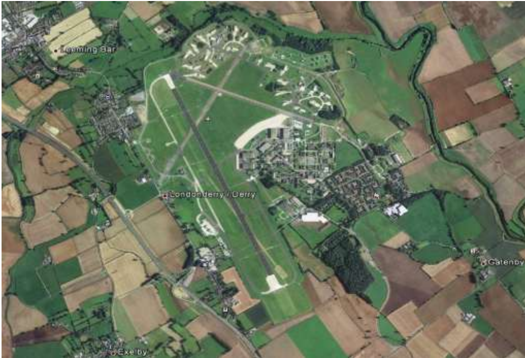
Leeming Air Station –